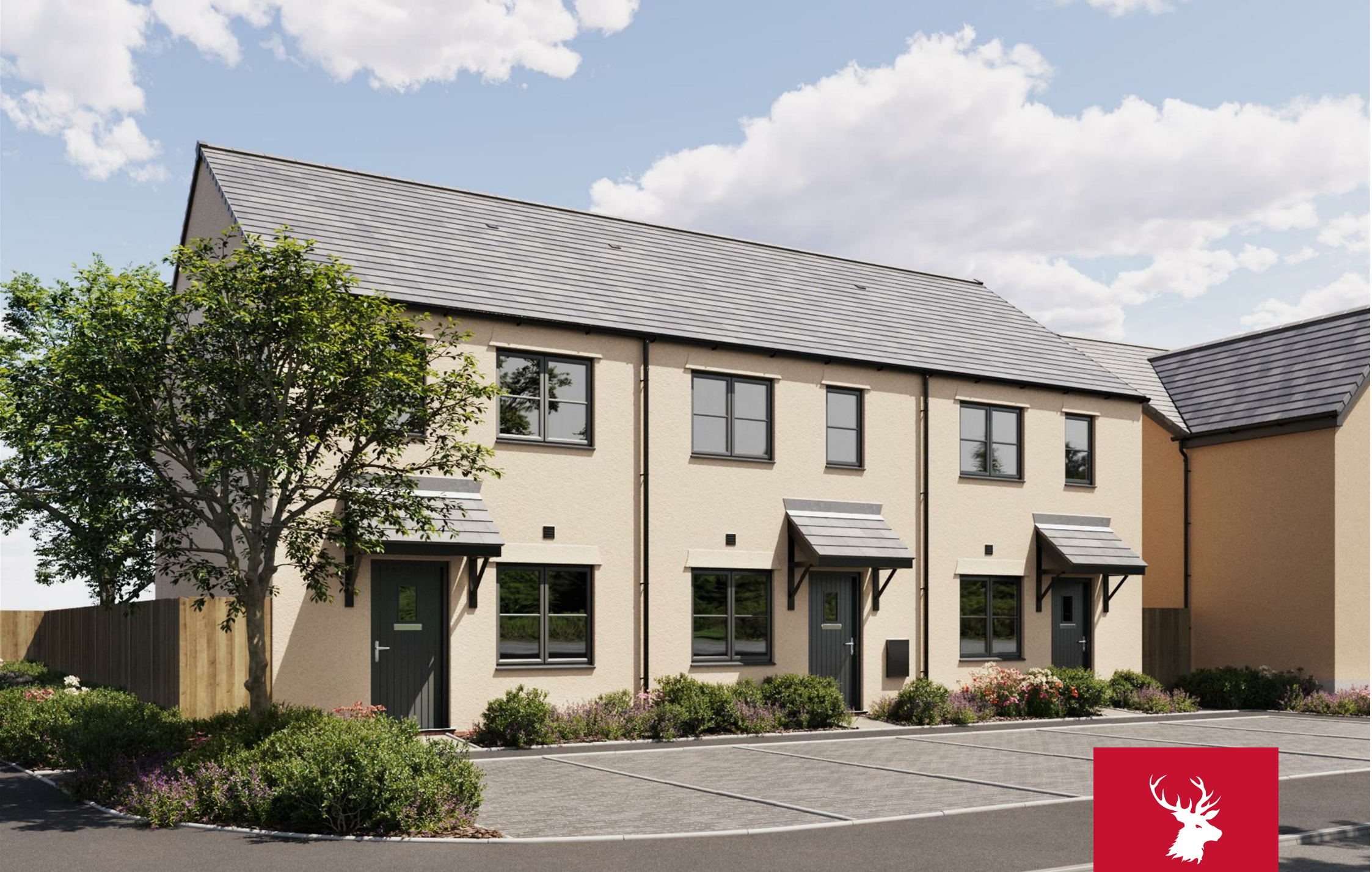
Plot 12 - The Gainsborough